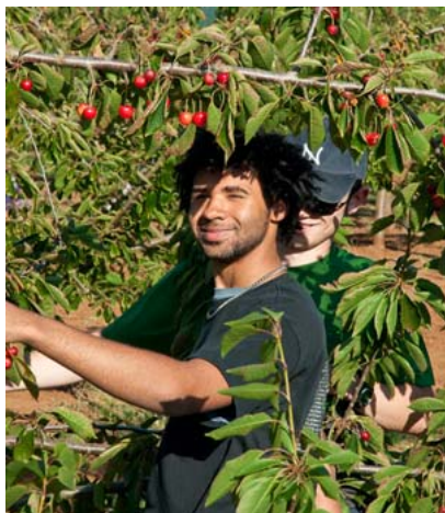
Cherry Harvest, August 2011

THANK YOU for your responses to our survey. Many of your suggestions last year enabled us to streamline our operations. Our biggest challenge is managing explosive growth; we have had an overwhelming response to harvest notifications, and many are filled within minutes. Our concern is that some pickers without frequent access to the Internet are those most in need of free food. Fortunately, not all harvests fill quickly. Next season, please help get the word to your friends who have lost jobs or are struggling with food insecurity.