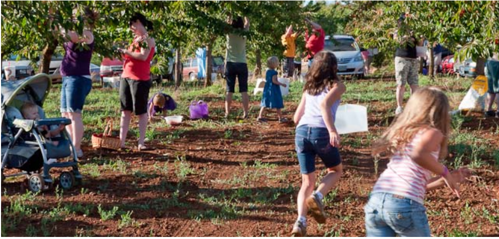
Cherry Harvest, August 2011