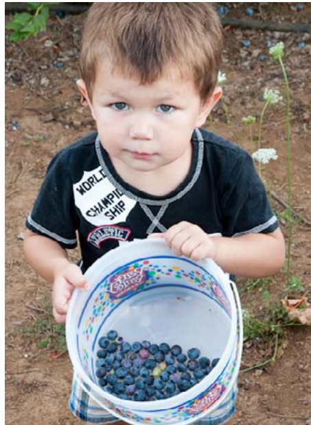
Blueberry Harvest, August 2011

Thank you, farm and home owners, harvest assistants and pickers. We look forward to seeing you in the fields and orchards next summer!